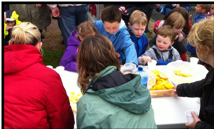
Parent volunteers providing refreshments following the PTA Sponsored Walk.

School bus, taxi or car... Always wear your Seat Belt!