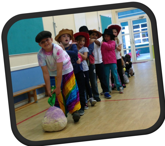
Junior Assembly: 'An Tonnapa Mór'

The PTA AGM will take place at the school on Tuesday 14th October at 7.30pm. All parents/guardians and staff are invited to attend. The AGM involves a review of our year's activities and the presentation of our financial report. There are also a number of vacancies on the PTA committee - if anyone is interested in getting more involved, please come along to the AGM or contact me on 086 822 5785.