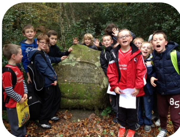
Recent trip by 3rd and 4th classes to Tomnafinnoge Oak Wood, Tinahely/Shillelagh.

Some of the themes from the Irish language curriculum would be covered, along with fun games & songs, tips for homework, grammar, oral work, etc. 7.30-8.30pm, Gorey Educate Together NS, beginning Tuesday 11th November. Cost: €20 per family for 5 Tuesdays.