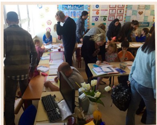
We hope that you enjoyed Open Classroom 2015!

Ref: School Guide for Parents & Guardians