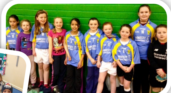
Our girls' Futsal team - finalists!