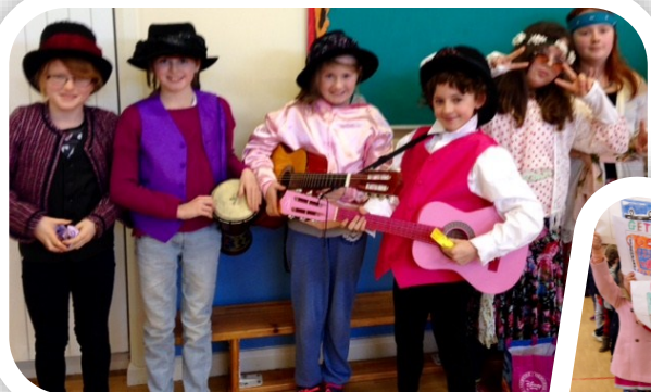
Assembly about the 1960's by 5th class. 'School - past, present & future' by 1st class.

Disco: We need a small group of parents to run our usual late February/early March school disco. What's involved: booking the DJ, buying supplies for the tuck-shop, putting together a rota of parent helpers for the event, etc. If this is a project that you can commit to, please leave your name and email address at the school office or email info@goreyeducatetogether.ie by this Friday.