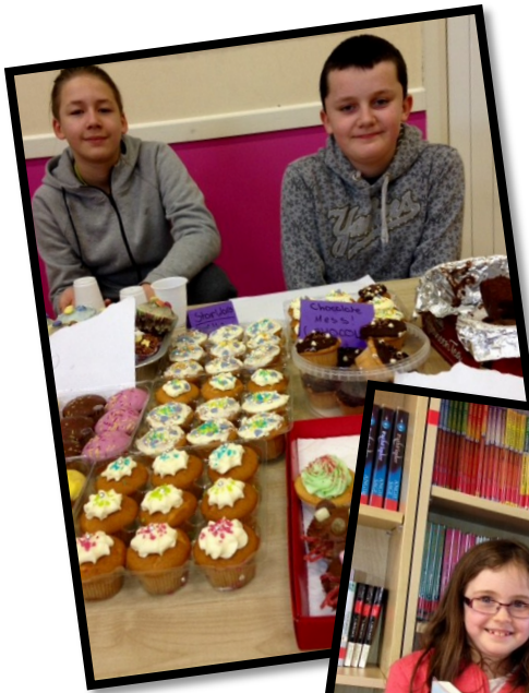
Bake Sale by the School Council: over €900 was raised for the Irish Cancer Society.