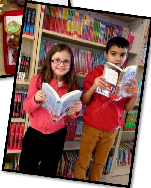
700+ new library books now in use, ('Spelling Bee' prize for the school.) More photos on school website.