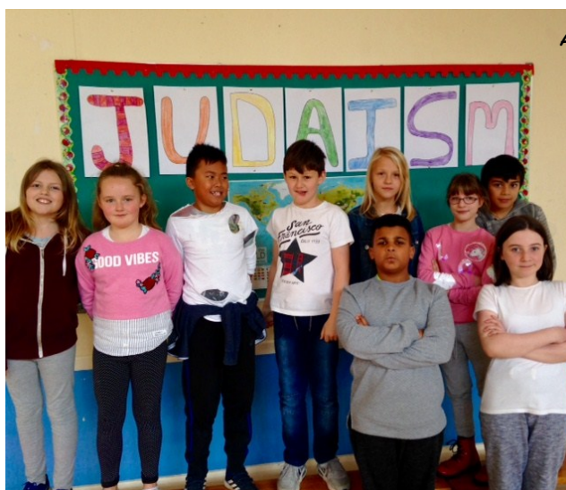
Assembly on Judaism by 4th class.

Please see overleaf for details of the next round of afterschool activities.