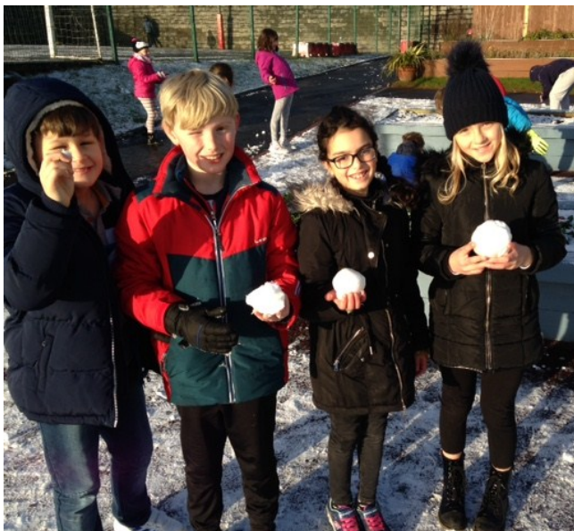
See school website for more photos.